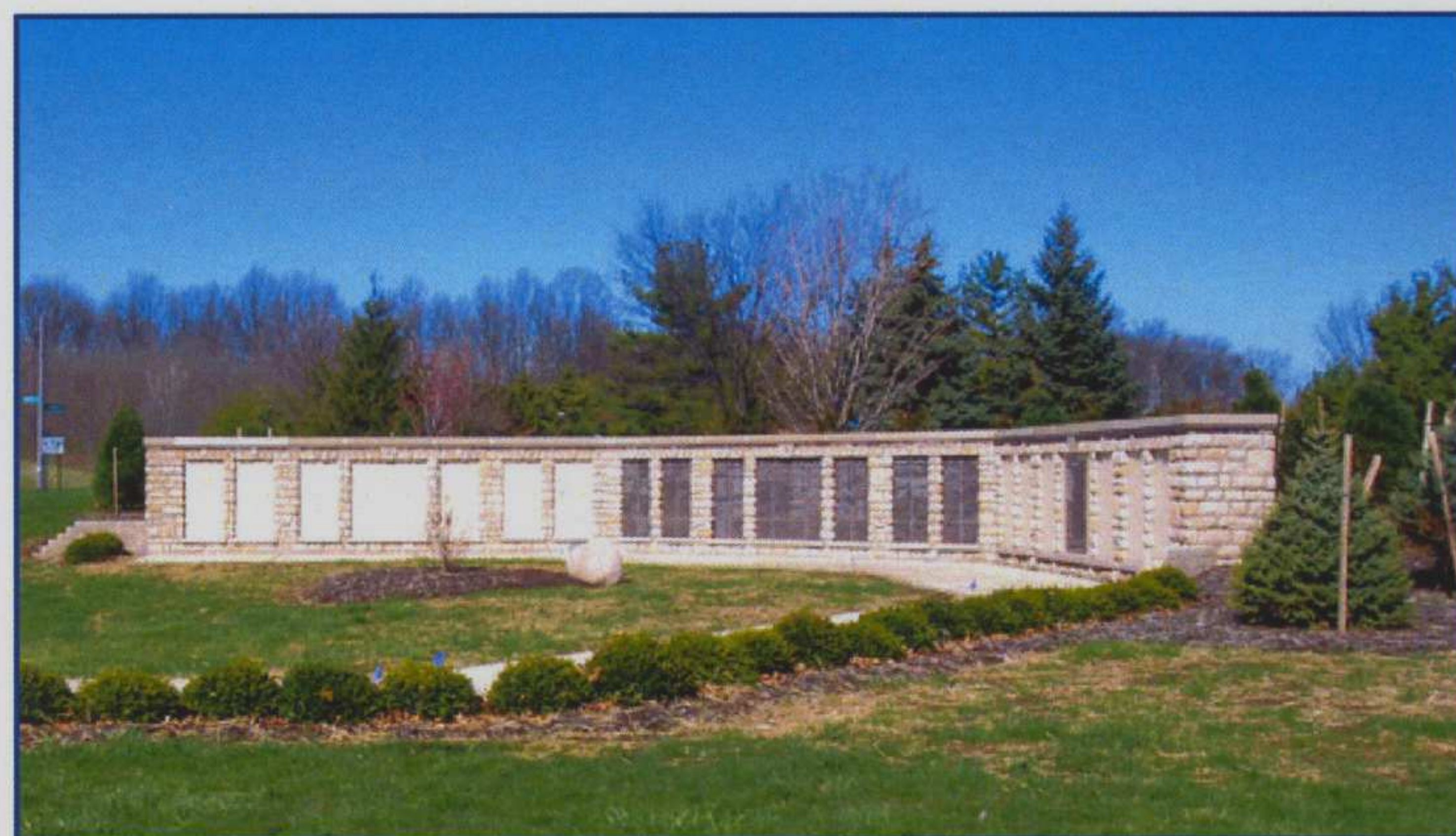
This picture of our Columbarium can be viewed on our church website: www.linworthumc.org .

Linworth United Methodist Church through the Historical Society has memorialized our early pioneers, many of whom were founding members of our church. We have continued at Linworth to remember the deceased members of our congregation by erecting a beautiful Columbarium adjacent to our Worship Center. The remains of Linworth's members and friends who have helped to advance the cause of Christ and His love and care to our world are reminders to us of the importance of keeping the faith of our heritage.